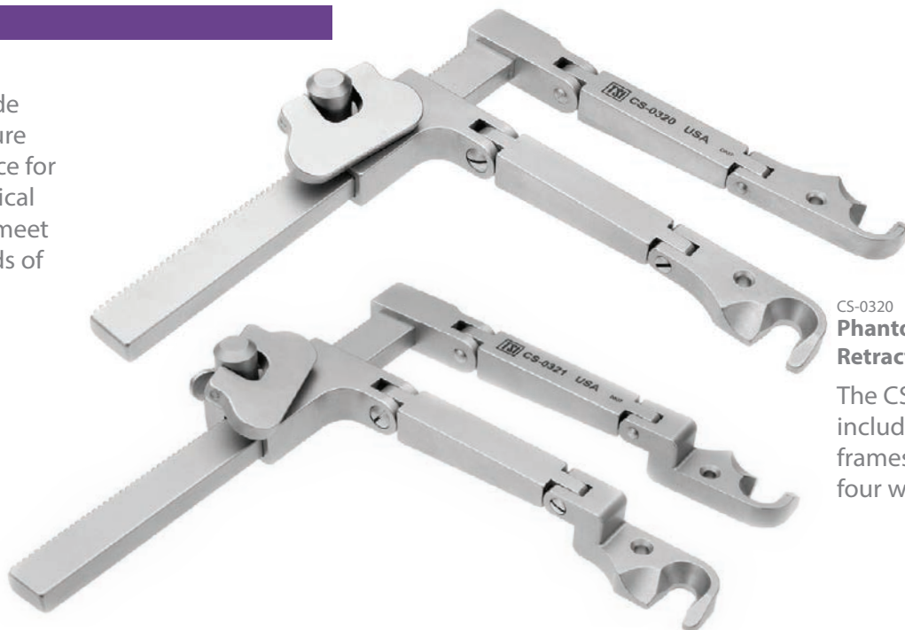
CS-0320 Phantom TL™ Transverse Retractor w/ Double Hinge

Side-Loading retractors provide an easy, yet secure attachment space for blades. TSI's conical style retractors meet the unique needs of the surgeon.