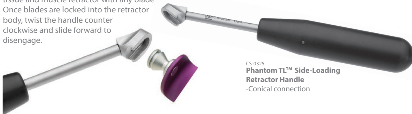
CS-0325 Phantom TL™ Side-Loading Retractor Handle -Conical connection

Retractor handles facilitate a quick connection to the retractor bodies. The blade handles may be used as a hand held tissue and muscle retractor with any blade. Once blades are locked into the retractor body, twist the handle counter clockwise and slide forward to disengage.