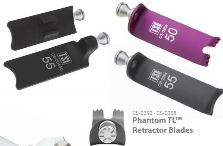
CS-0250 - CS-0268 Phantom TL™ Retractor Blades

Conical retractor blades come in a variety of lengths and widths in blunt and discectomy styles. TSI's unique paddle blades fit directly onto the distractor arms to provide maximum exposure with minimal wound opening.