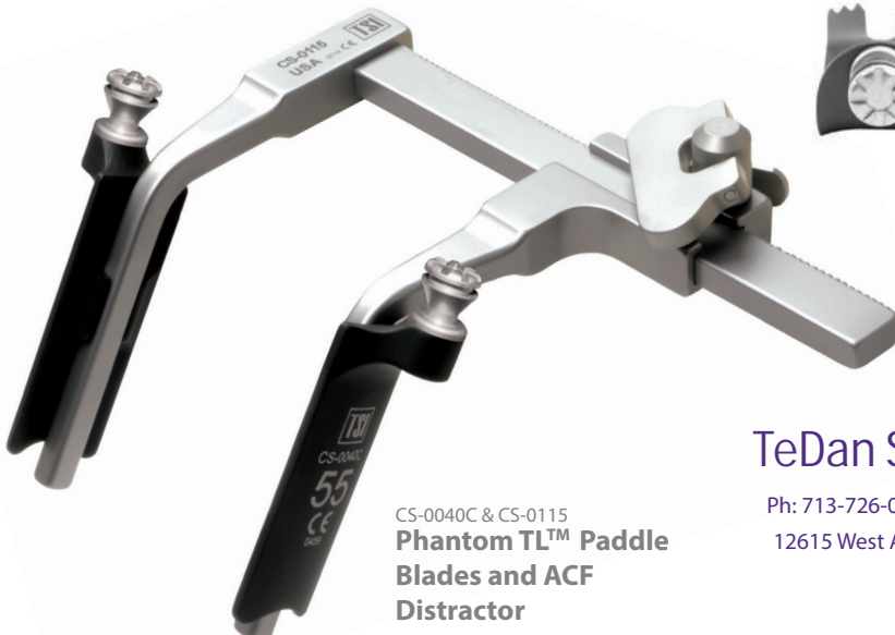
CS-0040C & CS-0115 Phantom TL™ Paddle Blades and ACF Distractor