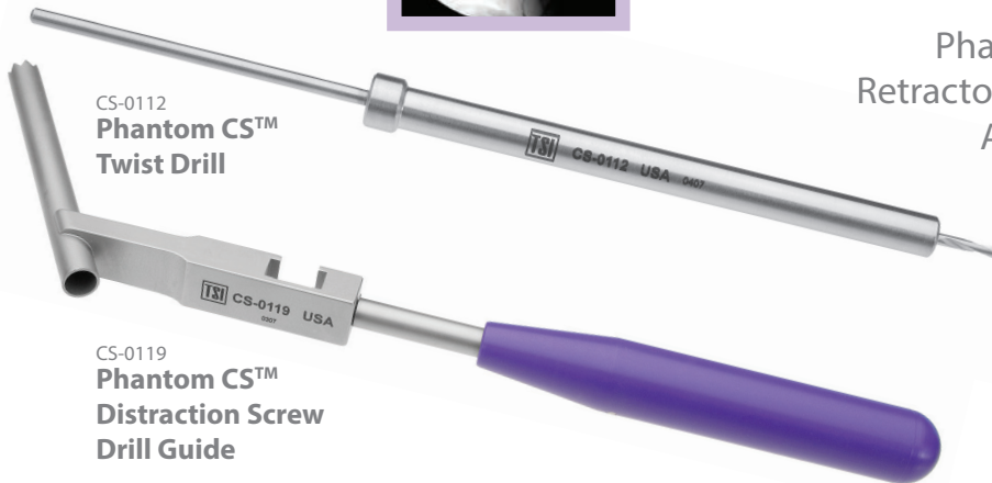
CS-0112 Phantom CS™ Twist Drill