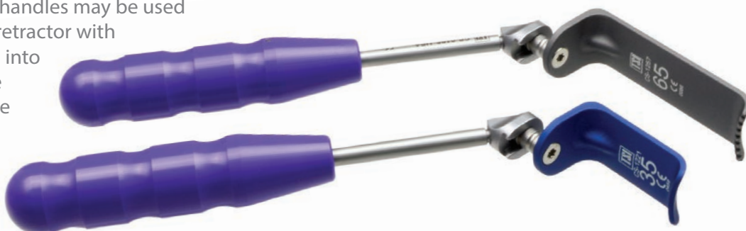
CS-0105 Phantom CS™ Side-Loading Retractor Handle

Cross cut connector prevents rotation of blade while attached to the blade handle