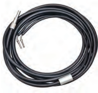
ML-0048 Phantom ML™ Light Cable, 10 ft., Strong Curve, w/ TeDan Connector -Reusable