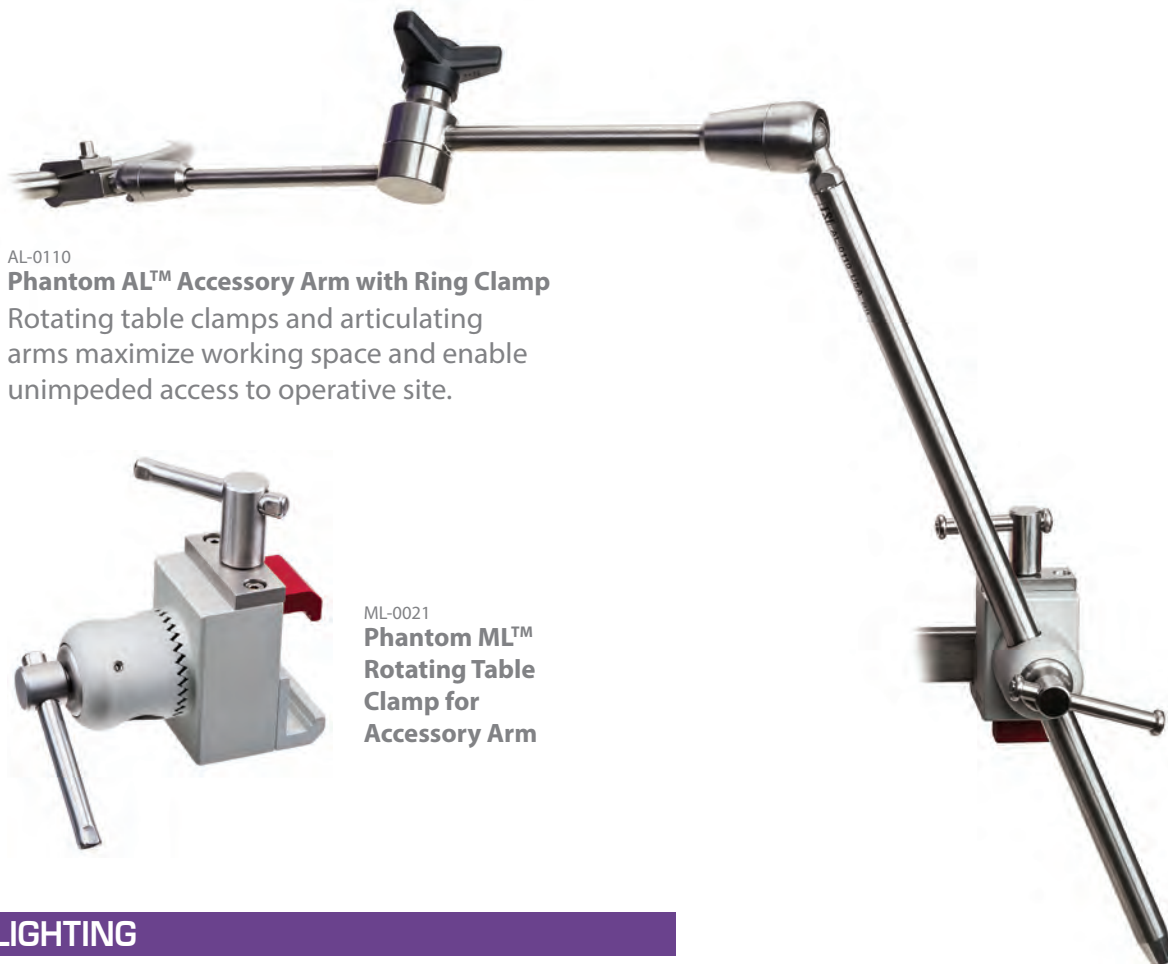
AL-0110 Phantom AL™ Accessory Arm with Ring Clamp Rotating table clamps and articulating arms maximize working space and enable unimpeded access to operative site.