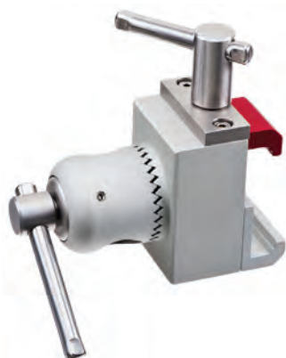
ML-0021 Phantom ML™ Rotating Table Clamp for Accessory Arm