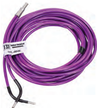
ML-0046 Phantom ML™ Light Cable w/ TeDan Connector -Sterile, Single Use Only