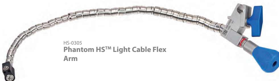
HS-0305 Phantom HS™ Light Cable Flex Arm

*ML-0046 not included in set, optional item