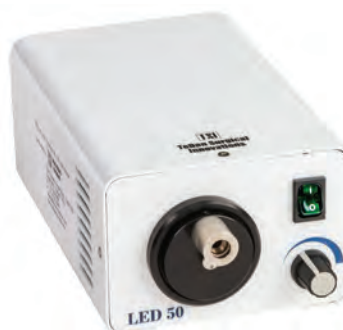
ML-0051 Phantom ML™ LED Light Source -Bright, 52-watt LED light source, cool light

*ML-0046 not included in set, optional item