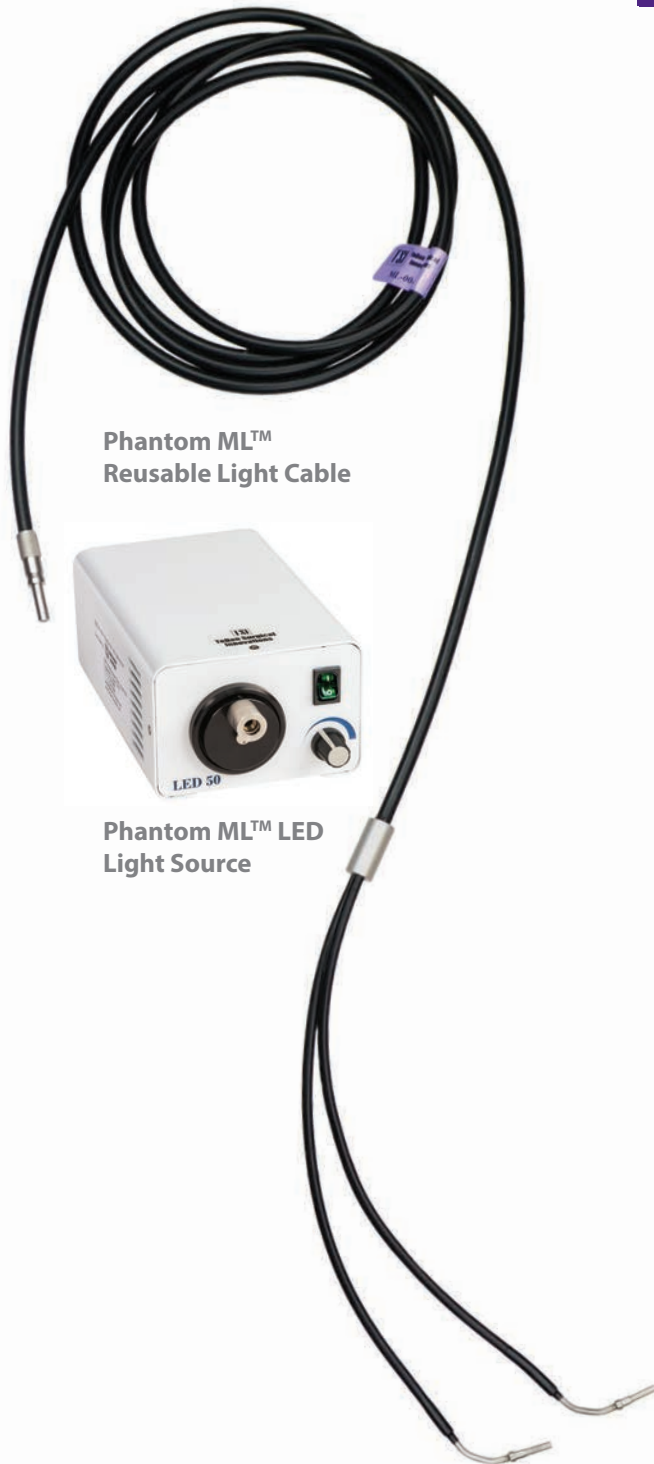
Phantom ML™ Reusable Light Cable