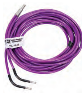
ML-0046 Phantom ML™ Light Cable w/ TeDan Connector -Sterile, Single Use Only