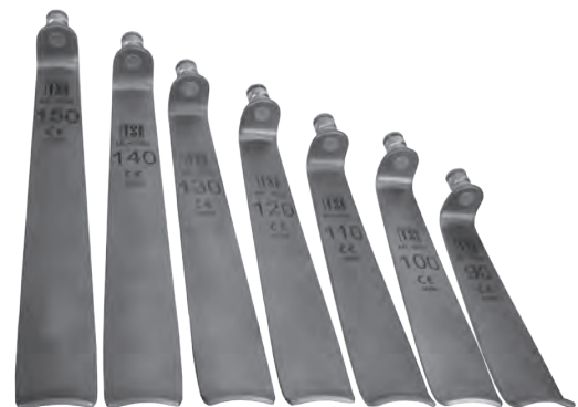
ML-0390 - ML-0396 Phantom XL™ Counter Retractor Fan Blades