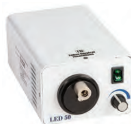
ML-0051 Phantom ML™ LED Light Source -Bright, 52-watt LED light source, cool light