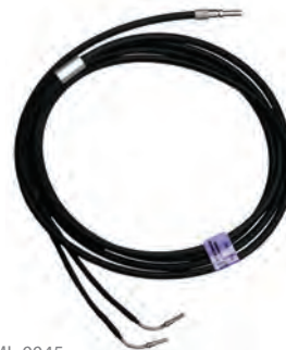
ML-0045 Phantom ML™ Light Cable w/ TeDan Connector -Reusable