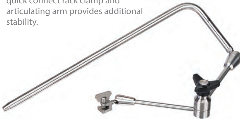
ML-0060 Phantom ML™ Articulating Accessory Arm

Retractors easily attach through quick connect rack clamp and articulating arm provides additional stability.