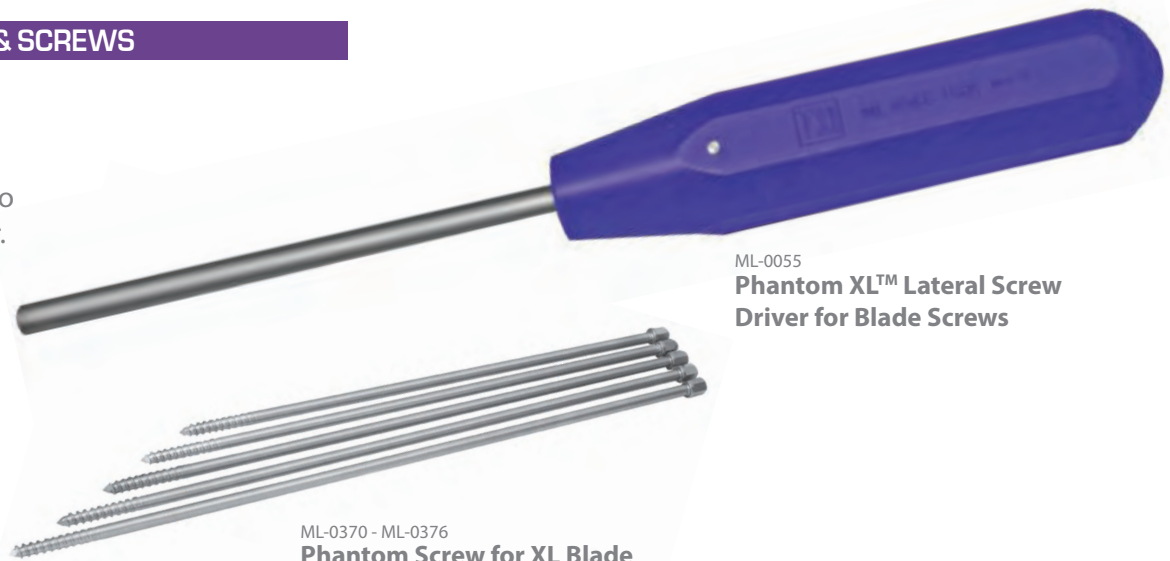
ML-0055 Phantom XL™ Lateral Screw Driver for Blade Screws

Screws can be inserted through cannulations on retractor blades to stabilize retractor.