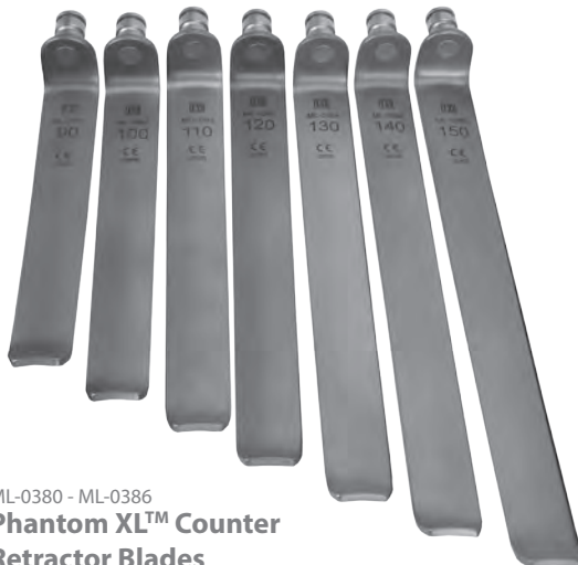
ML-0380 - ML-0386 Phantom XL™ Counter Retractor Blades

Counter retractor blades assist when three of four way retraction is needed. Blades are radiolucent and easy to see under fluoroscopy.