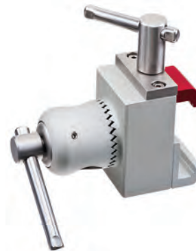
ML-0021 Phantom ML™ Rotating Table Clamp